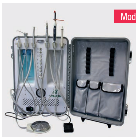
Model DU 893

To give you more flexibility in terms of price, weight and technical features, action medeor provides two different models of mobile dental units: