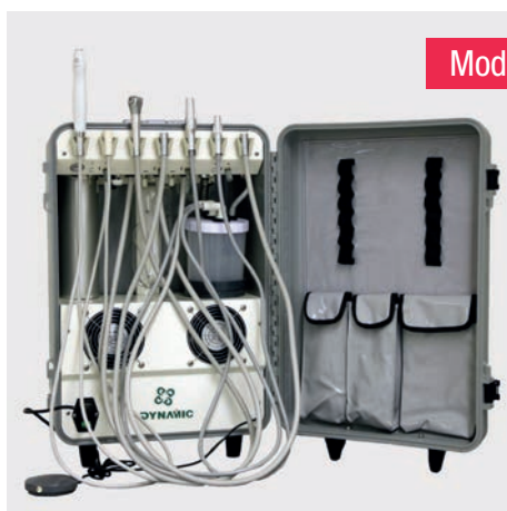
Model DU 852

This mobile dental unit is CE certified.